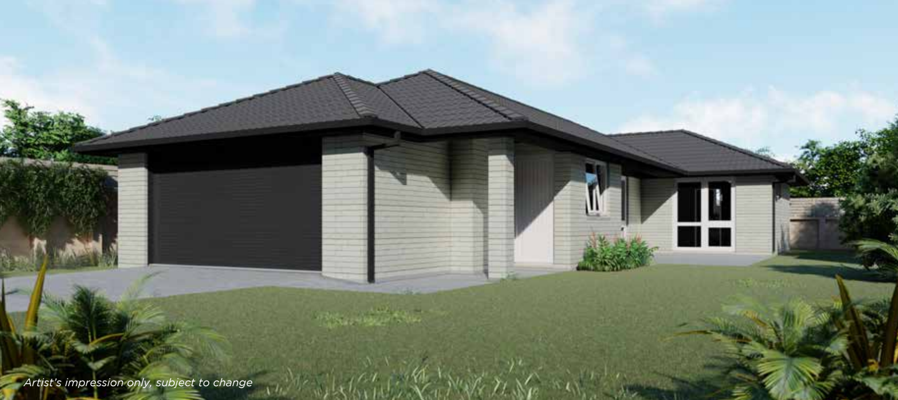
Artist's impression only, subject to change